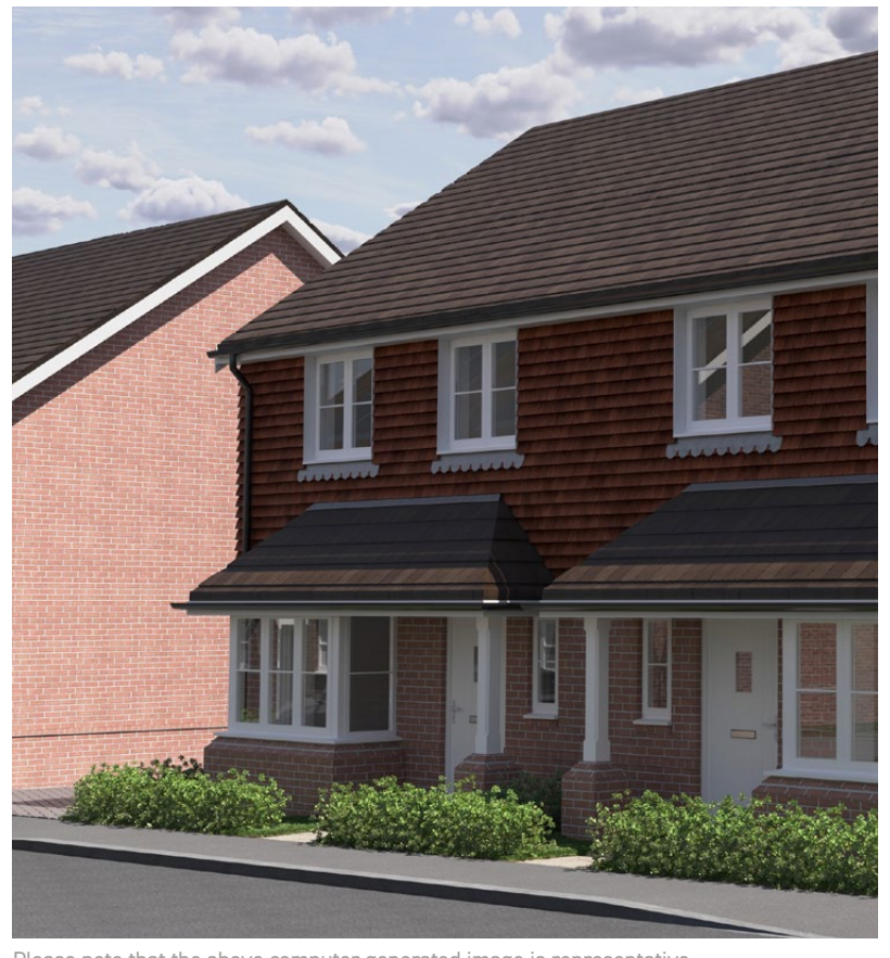
Please note that the above computer generated image is representative of the house type and not the specified plot as some details may vary.