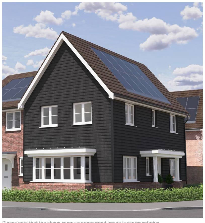
Please note that the above computer generated image is representative of the house type and not the specified plot as some details may vary.