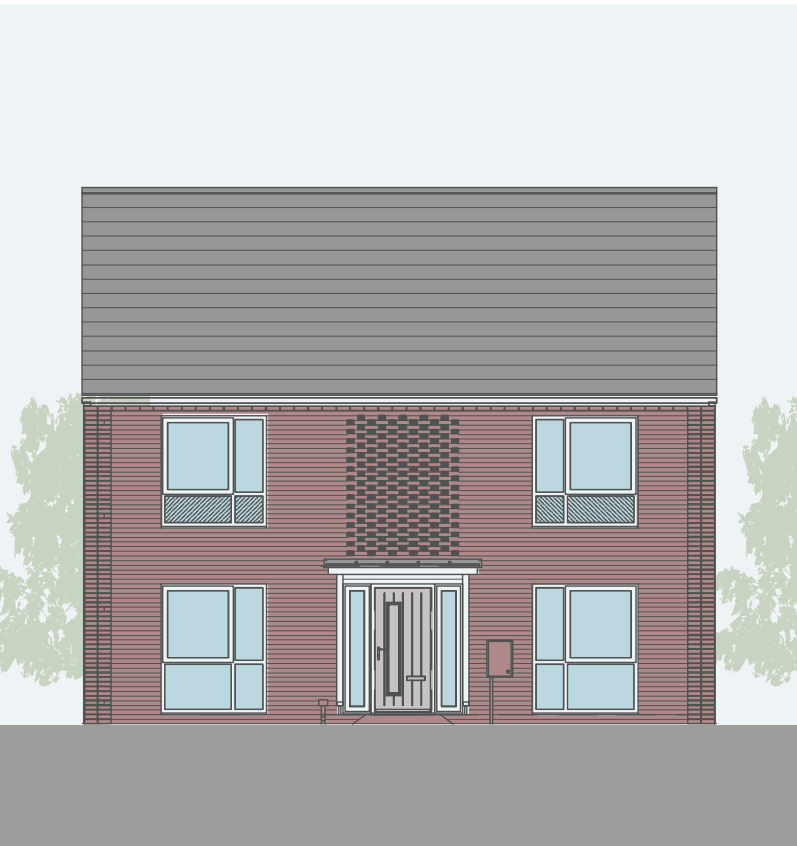
Images are representative of the house types and not necessarily the specified plots as some details may vary.

34 Hercules Drive, Wellingborough, Northamptonshire NN8 6EN