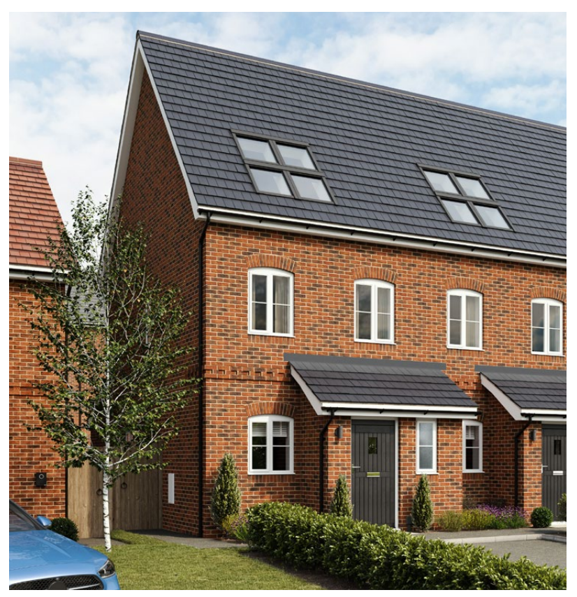
Computer generated images are representative of the house type and not necessarily the specified plot as some details may vary.