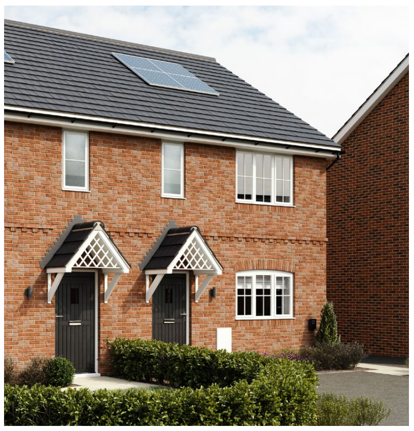
Computer generated images are representative of the house type and not necessarily the specified plot as some details may vary.

Two parking spaces Turfed rear garden Kitchen/Dining area Downstairs WC