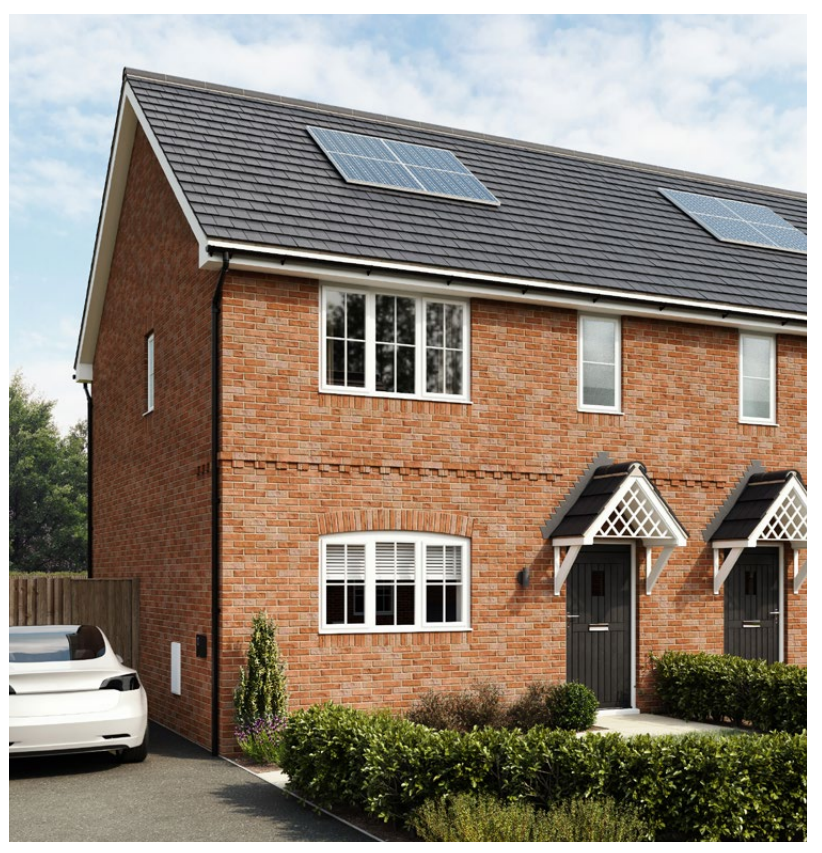
Computer generated images are representative of the house type and not necessarily the specified plot as some details may vary.

Two parking spaces Turfed rear garden Kitchen/Dining area Downstairs WC