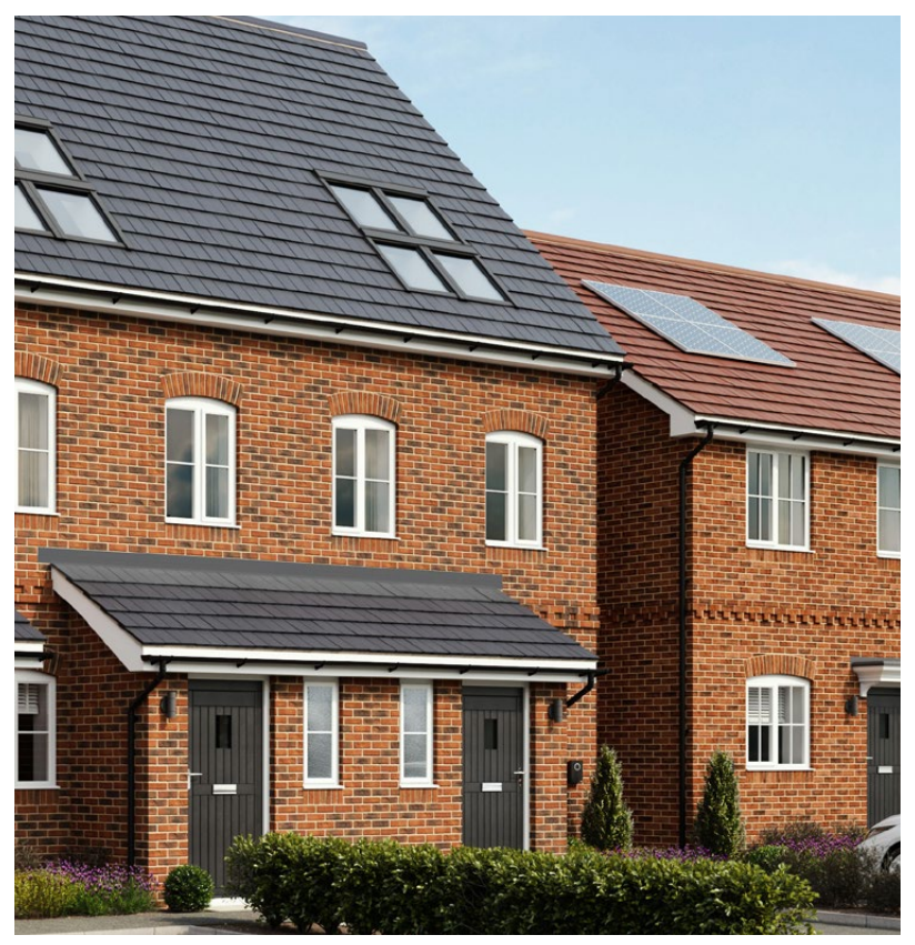
Computer generated images are representative of the house type and not necessarily the specified plot as some details may vary.