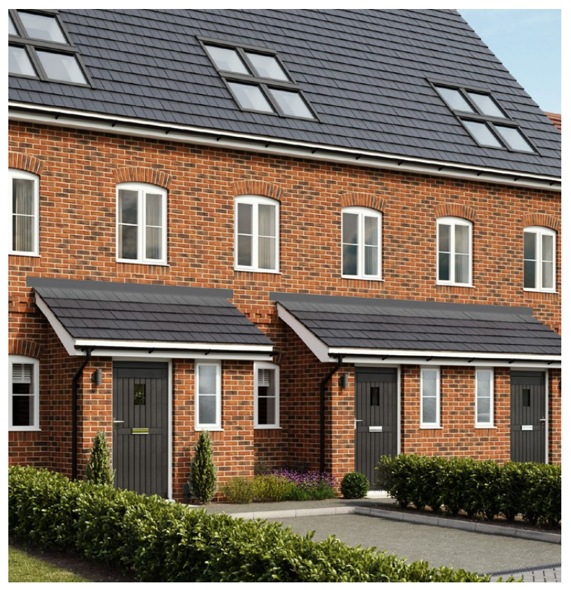
Computer generated images are representative of the house type and not necessarily the specified plot as some details may vary.