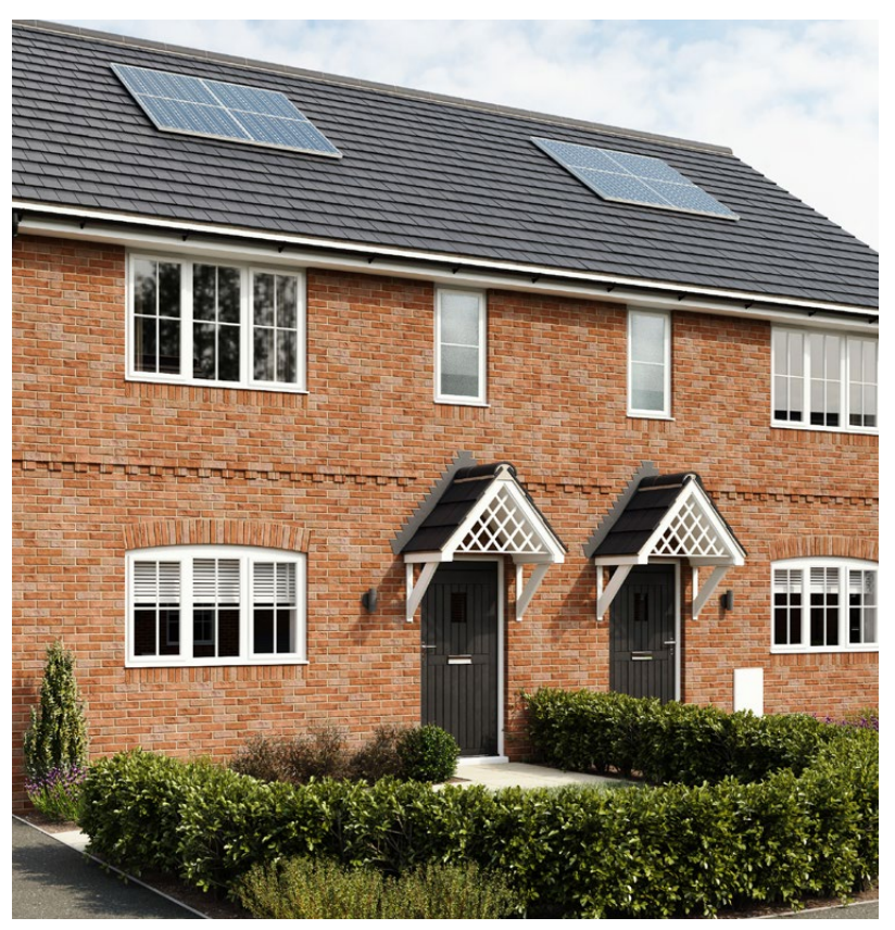
Computer generated images are representative of the house type and not necessarily the specified plot as some details may vary.