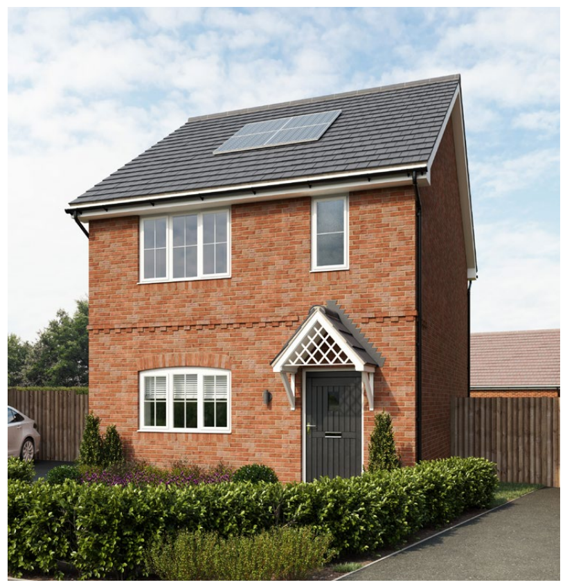
Computer generated images are representative of the house type and not necessarily the specified plot as some details may vary.